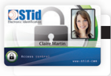
RFID cards: 125 kHz 13.56 MHz / UHF