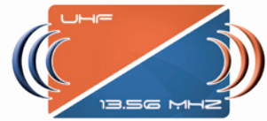
HYBRID cards 13.56 MHz + UHF