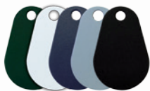
Graphic Prox key holders - PCG