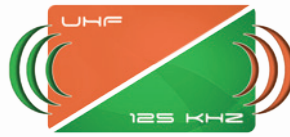
HYBRID cards 125 kHz + UHF