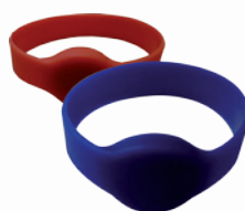
Silicone wristbands BSI