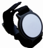
Prox wristbands BMS