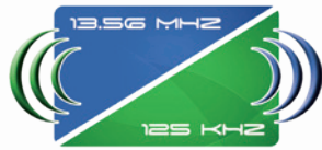
HYBRID cards 125 kHz + 13.56 MHz