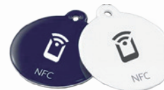
NFC stickers ETS